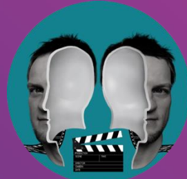
PR and Thought Leadership Strat