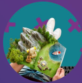
Sustainable Marketing Strat