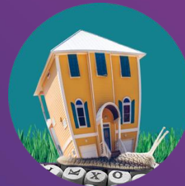
Organic SEO Strat