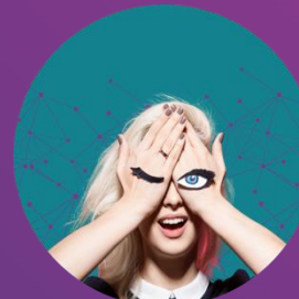
Interconnected Content Model